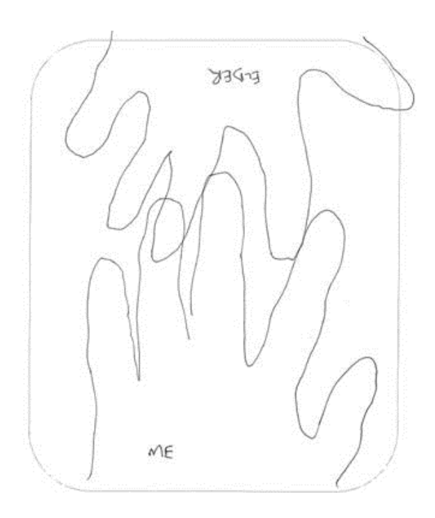
Figure 2. Reflective activity, service managers drawing of his own and an Elder's hand

When participants were asked to reflect on their engagement with the project and the experience of working together, one of the senior managers chose to trace his own hand and an Elder's hand (Figure 2). This, we believe, creatively speaks to the power of relationships and the engagement approach employed. By investing in this engagement phase, service providers are encouraged to look at systems change through a lens of trust, relationships and a Nyoongar worldview.