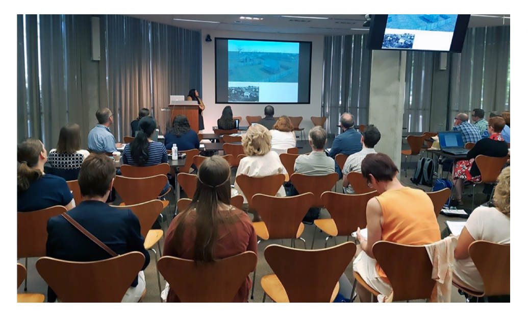
□ 01 The Advanced Challenges in Theory and Practice in 3D Modeling of Cultural Heritage Sites Workshop, at UCLA, 20-23 June 2016, noted the failure to preserve many Augmented Reality projects.