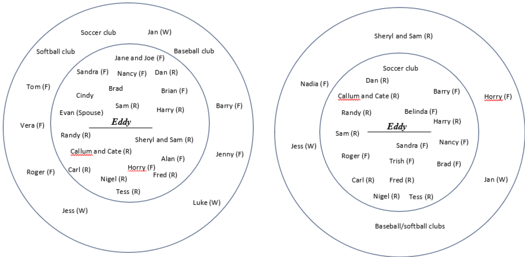
Figure 2. Social network maps, pre- and post-loss, for Eddy. R = relative, F = friend, W = work colleague.