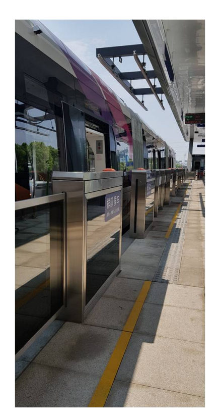
Figure 3. Trackless tram system station.