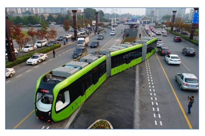
Figure 1. The Trackless Tram System developed by CRRC and demonstrated in Zhuzhou, China.

Three of the authors of this paper were able to visit China in August 2018 and ride the Trackless Tram as well as receive detailed explanations about how it works and how the transit system is constructed and operated. The paper is therefore based on this transit technology though it is not excluding other manufacturers such as Alstom, Van Hool, Irizar, and others. The technology was first taken to scale in China in 2016 on a straight 3.6 km line with 4 stations. Based on findings from the study tour to Zhuzhou, China it is the intention of this paper to not only demonstrate that the Trackless Tram is a superior technology for many corridor connections in urban transit systems but to explore the notion that it is potentially the public transport catalyst that many city planners have been waiting for since the dominance of automobile dependence, as it can unlock urban regeneration. It is the conclusion of this paper that not only is this technology a potential game changer for cities struggling to attract investment in traditional light rail projects, if implemented through an entrepreneurial approach in collaboration with the private sector it stands to unlock significant urban re-development options.