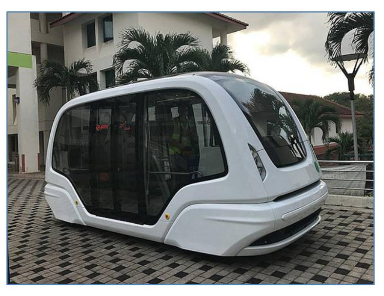
Figure 6. Trial Autonomous Shuttle on Nanyang Technological University campus in Singapore.

dependence while offering greater accessibility. However, there is one more major attraction of the Trackless Tram System that stands to provide a powerful drive for urban renewal and development. This is the city-shaping potential which is illustrated through two case studies in the following part.