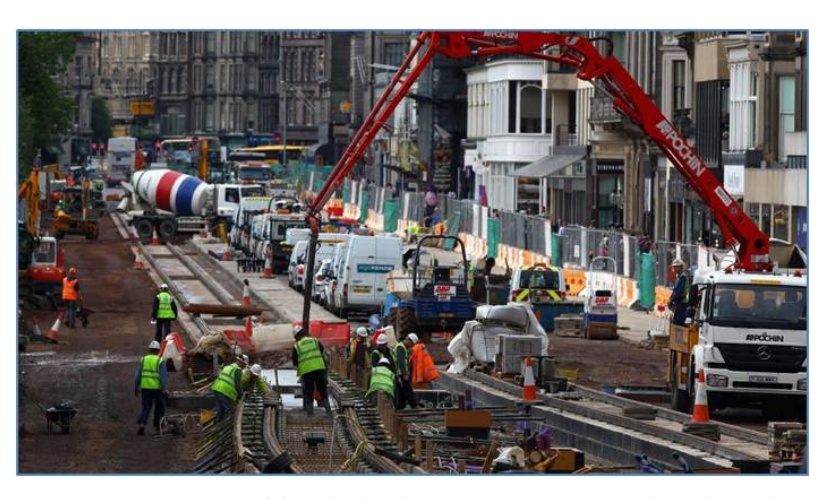
Figure 4. Construction of the Edinburgh tram project.

that may occur, fitting this data to the information sourced from the other guidance technologies to create an overall sense of the surrounding environment.