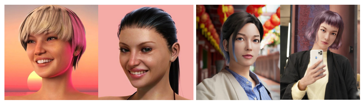
Figure 6: @amanda_bims (2020, 2021, Unknown) and @here_is_rae (2021, Singapore) unveil their updated "looks" (left: old; right: new).