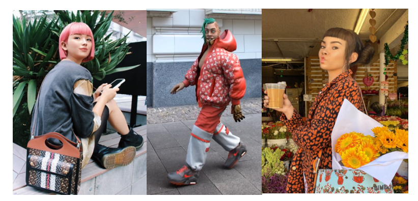
Figure 1: @imma.gram (2020, Japan) with a beloved Burberry handbag, @FNMeka (2020, US) flaunting a new streetwear ensemble, and @lilmiquela (2020, US) snapped on an outing to a local flower shop.

Since the mid-2010s, virtual influencers have attracted substantial press coverage and multiplying follower counts, with the most popular characters addressing hundreds of thousands of followers with their regular content uploads and "life" updates (Figure 1). As with their corporeal counterparts (see Abidin, 2018), this visibility has unlocked a litany of commercial opportunities, inspiring a budding industry interested in mobilizing their platforms for a parade of sponsored content and partnerships. Major brands have taken to designing their own virtual influencers as a marketing approach (Figure 2), and not-for-profit organisations have leveraged their effectiveness at attracting and engaging audiences to more widely promote important causes (Figure 3).