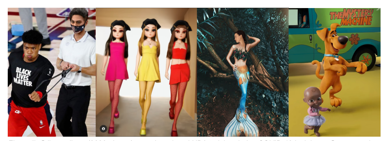
Figure 7: @liam_nikuro (2020, Japan) attends a closed NBA training during COVID-19 lockdown; @noonoouri (2021, Italy) spawns doubles for the #VersaceRunwayChallenge; @leyalovenature (2021, Switzerland) models as a mermaid; and @realqaiqai (2020, US) dances with Scooby Doo.