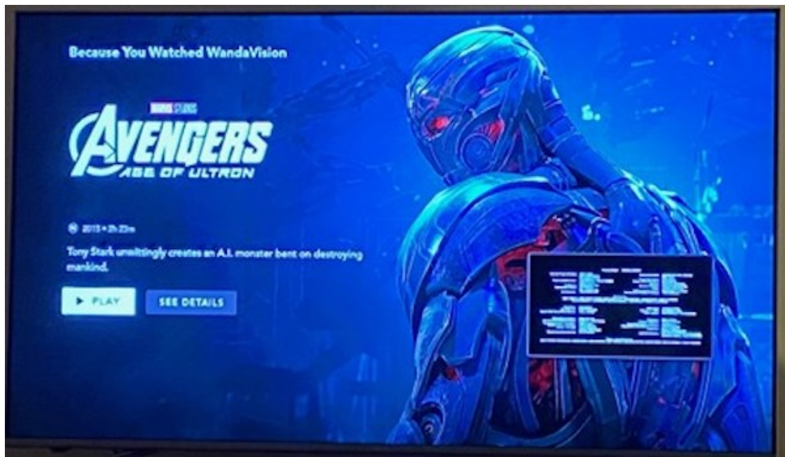
Figure 4: WandaVision credits directing viewers to watch Avengers: Age of Ultron on Disney+, screenshot by author (Disney, 2021b).

Ultimately, content such as WandaVision , which might once have been secondary to films with cinematic release, became essential during the pandemic. It encouraged audiences to become and then remain subscribed to Disney+, while also driving them to revisit prior MCU instalments with renewed interest (Barnhardt, 2021). At the end of each new WandaVision episode, Disney+ would recommend the viewer watch Avengers: Age of Ultron , the first appearance of Wanda and Vision, signalling it would be a good text to examine while trying to make sense of the show. Such a specific pairing of content speaks to the ability for transmedia storytelling to keep a back catalogue of content topical and fresh, which has been vital for Disney as it worked to populate a sparse streaming platform. It also highlights the efficacy of streaming as a home for transmedia content. Disney+ is used in this example as a space where Marvel can sequence texts and provide audiences with navigation frameworks to explore the MCU.