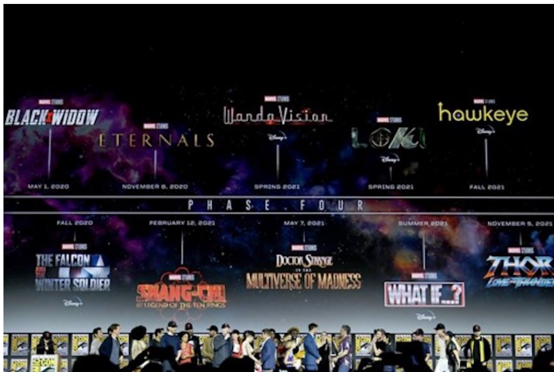
Figure 1: The Marvel Phase Four Timeline, revealed at San Diego Comic Con, 2019 (Winter in Alexander and Liptak, 2019).

The pandemic forced Marvel to rely solely on their streaming plans, for a period. Luckily, the pandemic hit during a natural narrative gap within the MCU, after the conclusion of the Infinity Saga and just prior to the launch of Phase Four. Keen to delay the release of Black Widow , Marvel were able to reorganise the Phase Four timeline to shift focus towards the release of their new streaming shows (Vary, 2021). WandaVision , a show focusing on two lesser-known Avengers Wanda Maximoff and Vision, was originally set to be Marvel's second Disney+ show (after Falcon and the Winter Soldier ). However, since WandaVision was being filmed primarily on closed sets, it could be completed comparatively quickly during the pandemic (Fleming, Jr., 2020). Marvel had promoted the show as a creative risk for the MCU and this was in part because, within the fixed events of the MCU storyworld, Vision was deceased at the time. However, after 18 months of releasing no new content, WandaVision became Marvel's best opportunity to reengage audiences starved for content.