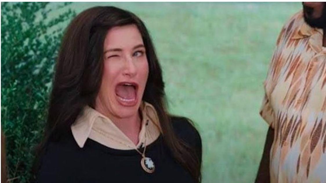
Figure 3: Agatha Harkness winking (Disney, 2021a).

In the content vacuum of the pandemic, the show's innate "spreadability" (Jenkins, et al. , 2013) could be seen in amplified fashion. WandaVision aired against little other competition and theories and discussions rippled across social media platforms (Mayberry, 2021). Phillips (2012) outlines different levels of engagement that transmedia producers can expect from fans, suggesting 80 percent of fans will be passive, 15 percent will be engaged, and five percent superfans. However, it is reasonable to speculate that the pandemic gave a greater percentage of the audience time to become more active fans. Online fan content produced about the show became unavoidable. Key character moments became instant memes, such as Agatha's infamous wink. In fact, Agatha became such a talking point that the song featured in the show announcing her villainous revelation rocketed up the iTunes charts (Zellner, 2021). The villain Mephisto was rumoured to appear (given his presence in key comic book storylines) and fans took pleasure in concocting ludicrous theories as to when and how the character could be unveiled.