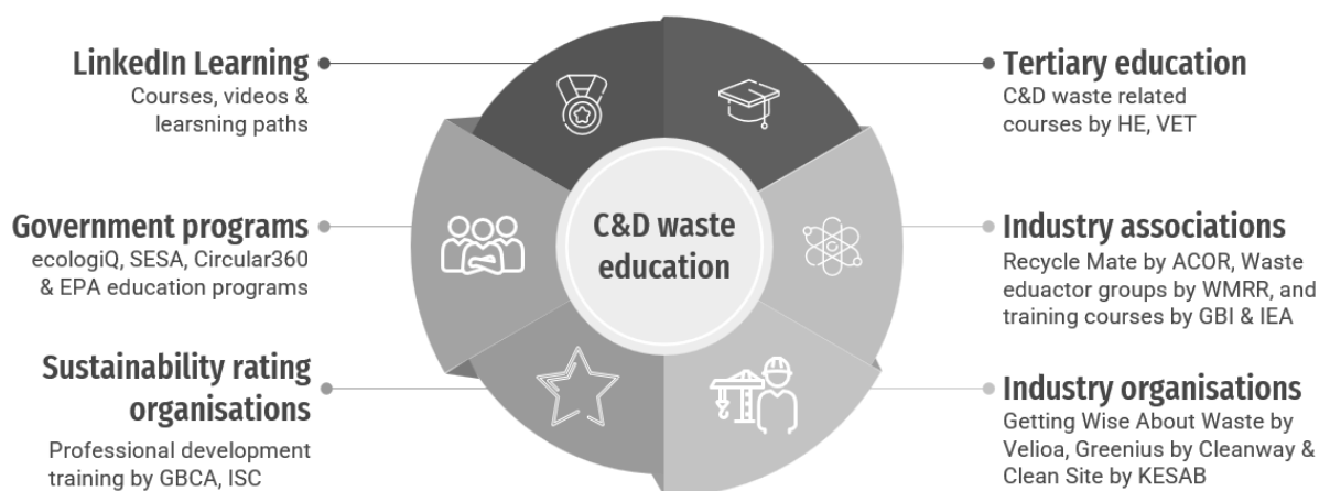
Figure 97. The most common educational opportunities in Australia

this section explores the extant educational opportunities for stakeholders involved [will be involved] in C&D waste supply chains. As illustrated in Figure 1, six common educational opportunities are provided by both the public and private sectors.