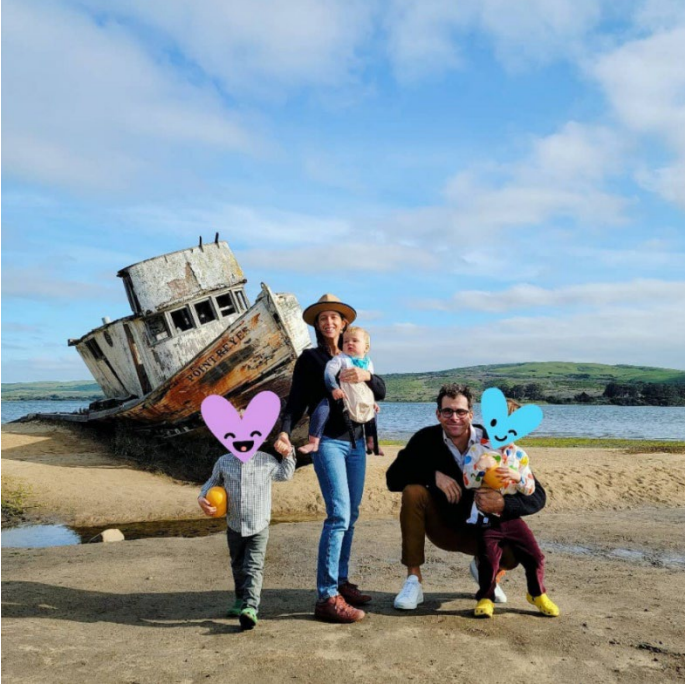
Figure 2. Mosseri, 5 April 2021, https://www.instagram.com/p/CNRCGsvFII_/