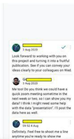
FIGURE 1 Gabriel's reflective journal entry shadowed by the lead researcher. [Color figure can be viewed at wileyonlinelibrary.com ]

Prior to joining this mentoring project, I didn't really have any concrete projects. I just had some areas that I was particularly interested in, such as learner variables, especially environmental and contextual variables. Over the past few months, I've read a lot about Complex Dynamic Systems (or reading about Marta's research) and found it super interesting.