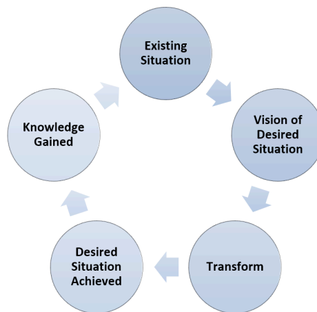
Figure 2: A simplified transformation cycle informed by Karp (2006)

The domains of leadership and management, culture, process and technology interact to transform the existing situation to a desired one. This is summarised in figure 1.2.