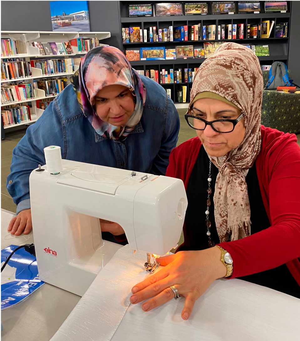
Figure 1. Photo example of a community-based event (sewing group).

identifying opportunities. This study has been approved by the Curtin University Human Research Ethics Committee (HRE2020-72827). All participant names are pseudonyms.