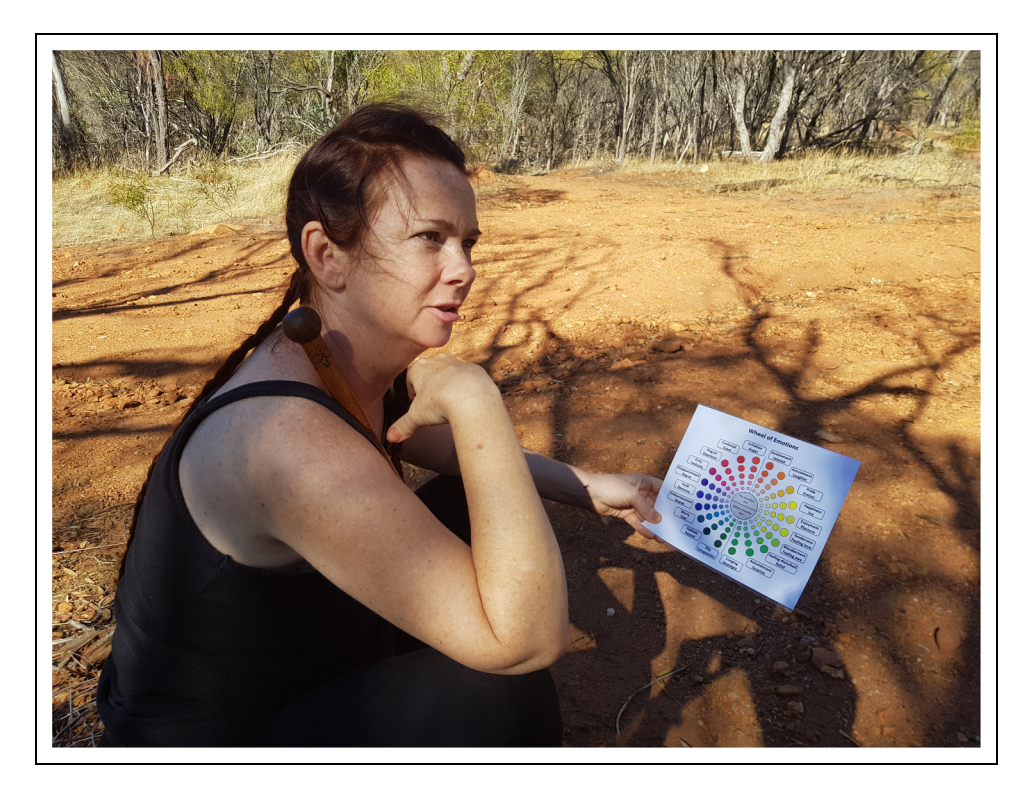
Figure 2. A participant verbalising her felt emotions on the Geneva Emotions Wheel.

imbued with Indigenous history and cultural significance. We also visited hard-worked farmland and barren agricultural trial plots, well-maintained parks, public gardens, and dog paths in urban settings, remote bush and dense forests, pinkish-white salt lakes, a shrine dedicated to a lost friend, a small-town theatre, and even an old shed remodelled as a tree-changer arts workshop that hosts a monthly cocktail party. Given that these were all special places and spaces in which people relax, cherish memories, seek peace and solitude, and find therapeutic escapes and solace, almost all emotional states conveyed to us about these places emphasised enjoyment, pleasure, happiness, joy, involvement, interest, pride, and/or elation. The last was particularly the case for domestic spaces such as houses, gardens, and farms over which participants expressed most control; they enable active emotional and material beautification and creation that further intensify place attachment. Wonderment and awe were often expressed with natural settings outside the immediate home boundaries, with places that induce spatial and temporal reflection, such as being able to remove oneself from the oppressiveness of the city and, for some, tuning into Aboriginal knowledge systems.