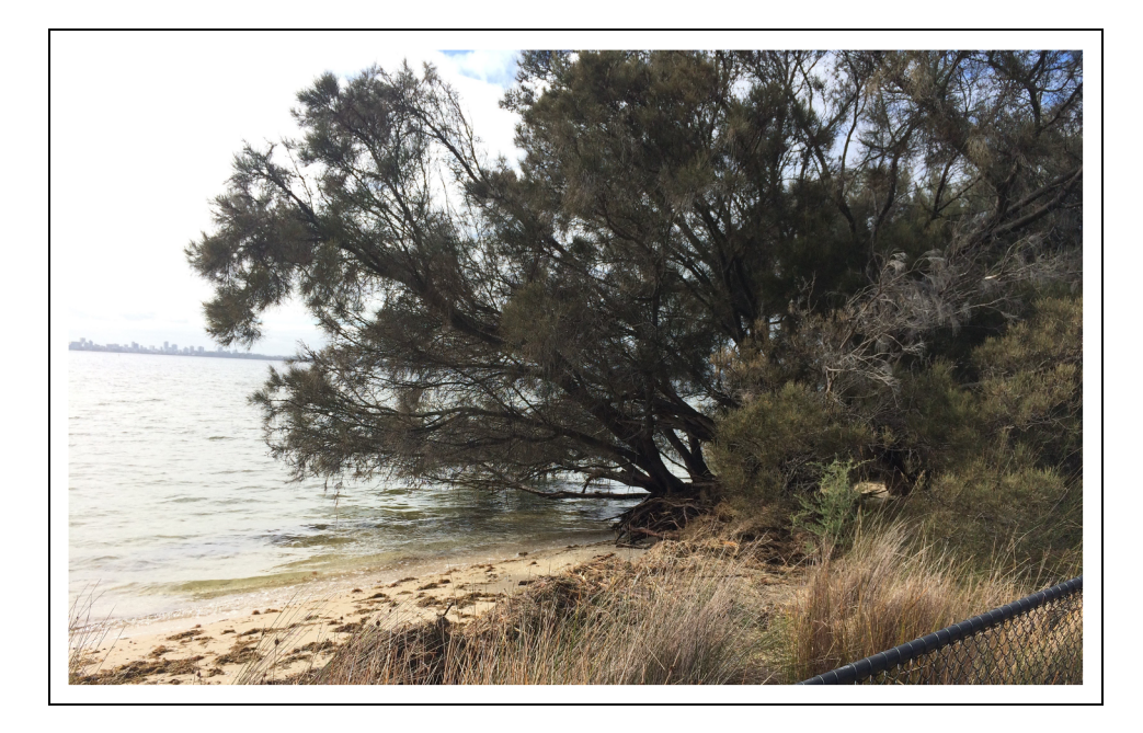
Figure 3. Flooding, river erosion, and dying trees along the Swan River.

For instance, Jackie<sup>1</sup>, a resident in an affluent suburb south of Perth, expressed intense worry and fear over the shifting seasons, the excessive heat, and rising water levels in the Swan Estuary, despite the building of defensive limestone walls where there used to be a beach. She said: ' The Earth is heating up. Climate change is not acceptable but it is inevitable.... I worry for my grand-children, for what's going to happen in their lives. Climate change requires us to change. We can't just bury our heads in the sand '. In a nearby spot on the foreshore, Bronwyn shared her high levels of sadness and fears witnessing the estuary and coastal erosion, the increasing swampiness of the foreshore, and big dying trees (Figure 3), yet wished to remain somewhat hopeful that ' people will be looking after this place, planting natives, and doing retaining '. Monica, a single mother in a