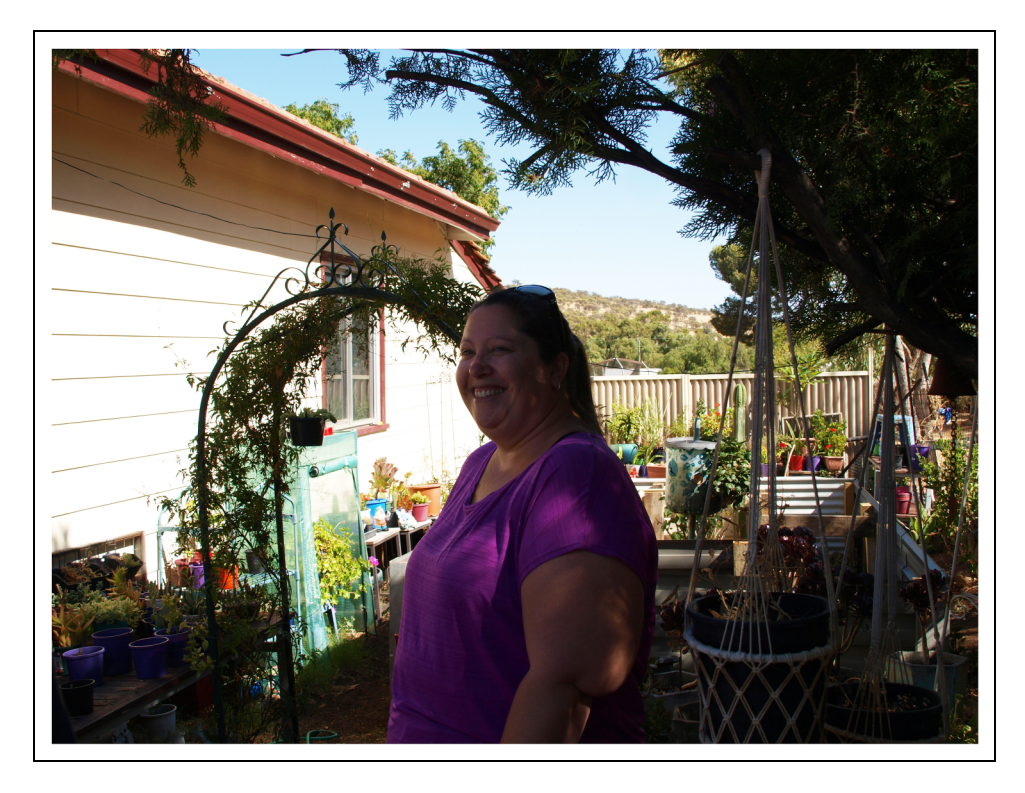
Figure 4. A participant in her home garden refuge.

so-called rural SuperTown \sim 100 km inland, is rather angry about the more frequent hot days and frost that afflict her small garden paradise (Figure 4), but she tries to keep her emotions at bay: 'If you let bad emotions get a hold of you, you spiral. I can't control the weather, so I need to take steps to manage what I do with my plants and my emotions ... like building a living shade'.