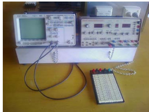
Figure 2 – Equipment supplied for the Active Network Synthesis experiment

The students are provided with the following instruments and equipment: A function generator, power supply, dual trace oscilloscope and a breadboard (figure 2)