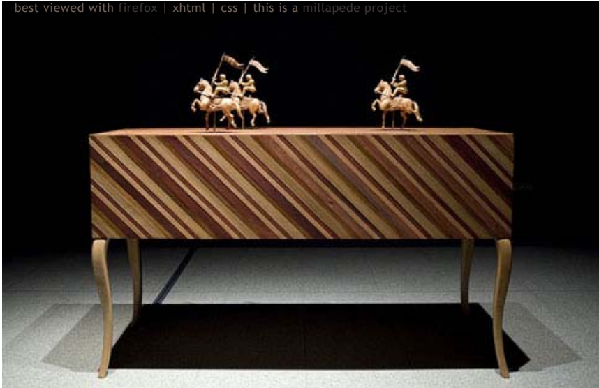
arc de triomphe carved western cedar + electronic components 200 x 100 x 110cm 2010 $22,000

best viewed with firefox | xhtml | css | this is a millapede project