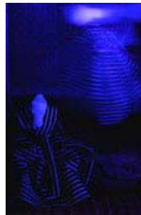
night flyer #3 digital image [glow in the dark components under uv light] 29 x 19cm 2011 $500 framed