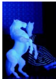
night mare and night rider digital image [glow in the dark components under uv light] 29 x 21cm [image size] 2011 $500 framed