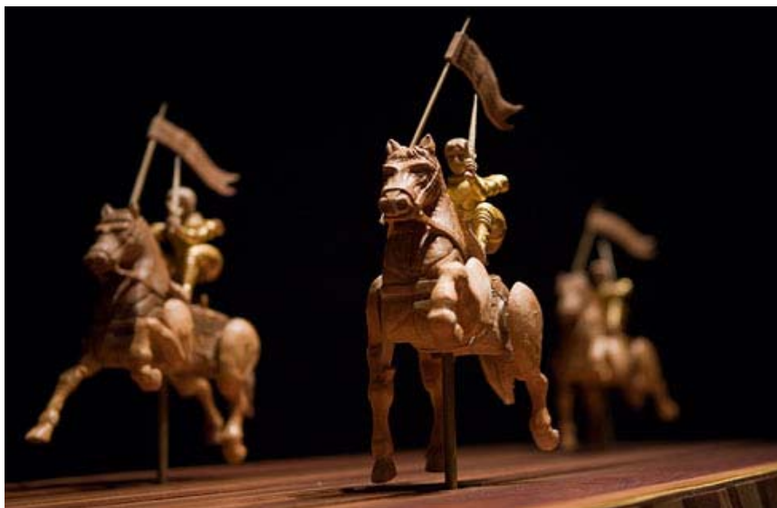
install shot