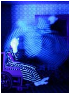
night flyer digital image [glow in the dark components under uv light] 28.5 x 21cm [image size] 2011 $500 framed