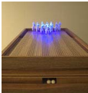
night mare jarrah, meranti, maple, cedar, oak, silicon horses, ball 350 x 170 x 120cm 2011 $20,000