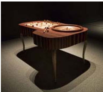
toute le monde gagne wooden roulette table carved from maple, cherry, nyotah, jarrah, pine, wood burned drawings and gold leaf 180 x 120 x 110cm 2010 $18,000