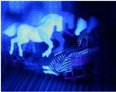
night mare and night rider #8 digital image [glow in the dark components under uv light] 22 x 28.5cm [image size] 2011 $500 framed