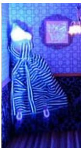
shod through the night digital image [glow in the dark components under uv light] 25.5 x 15cm [image size] 2011 $500 framed