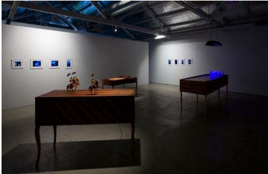
install shot