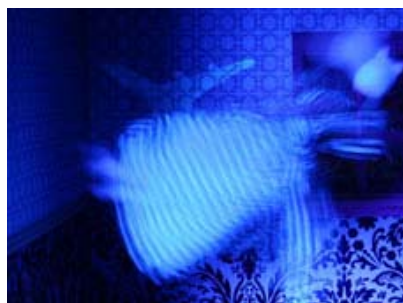
night flyer #1 digital image [glow in the dark components under uv light]