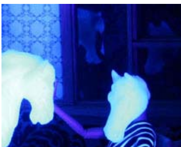
night mare and night rider #9 digital image [glow in the dark components under uv light]